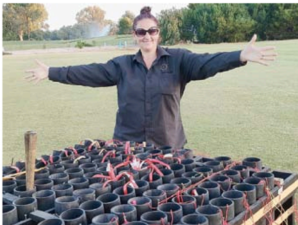
Ashes to Ashes offers a unique yet personal way to commemorate the loss of a loved one by scattering their cremated ashes high into the sky through fireworks.

"We have celebrants and funeral directors on hand, organise cremations if required, deploy fireworks in conjunction with music that is special to the person and their family, as well as own portable PA systems so no matter where you are, we